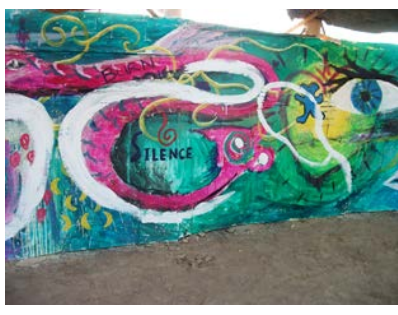
Figure 20b Inbetween right segment (photo: AntheA Delmotte).