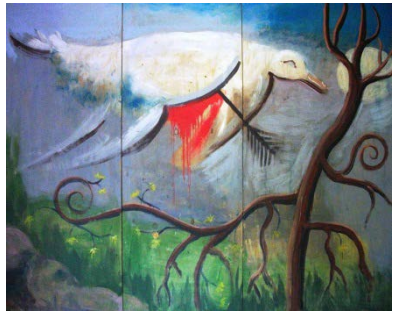
Figure 7b AntheA Delmotte, Wounded Freedom, 2014, performed with HA!Man and Joke at Adullan.

Thereafter, only two days after Wounded Freedom , she performance painted with Croak at Steenbokfontein Art Gallery for a second time. This event, billed as Cross-pollinate featuring Croak and the Pythian painter , represents a significant conceptual and maturing visual arts step for Delmotte in her search for parallel, yet interwoven, ways of experiencing and expressing creative impulses and processes. The poster (figure 8a) features Delmotte crouched in a near-