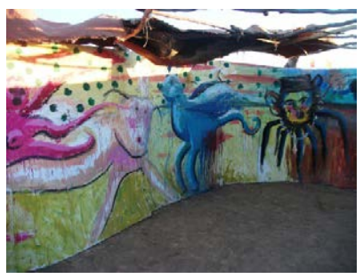
Figure 20e In between left segment.