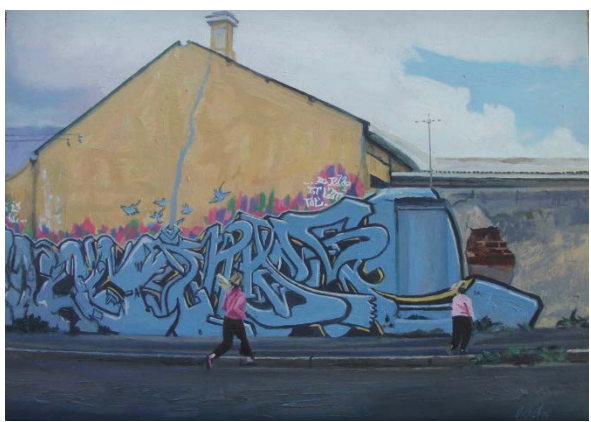
AntheA Delmotte, Bo-Kaap tot laat toe , 2016, oil on canvas 50 x 35cm, Piket-Bo-Berg, collection the artist (photo: AntheA Delmotte).