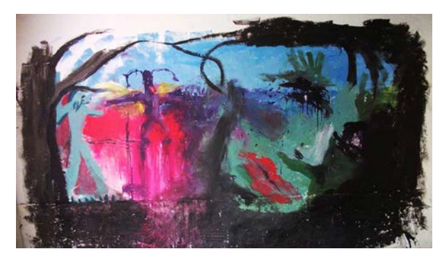
Figure 6a AntheA Delmotte, I am , 2011, wall-size mural.