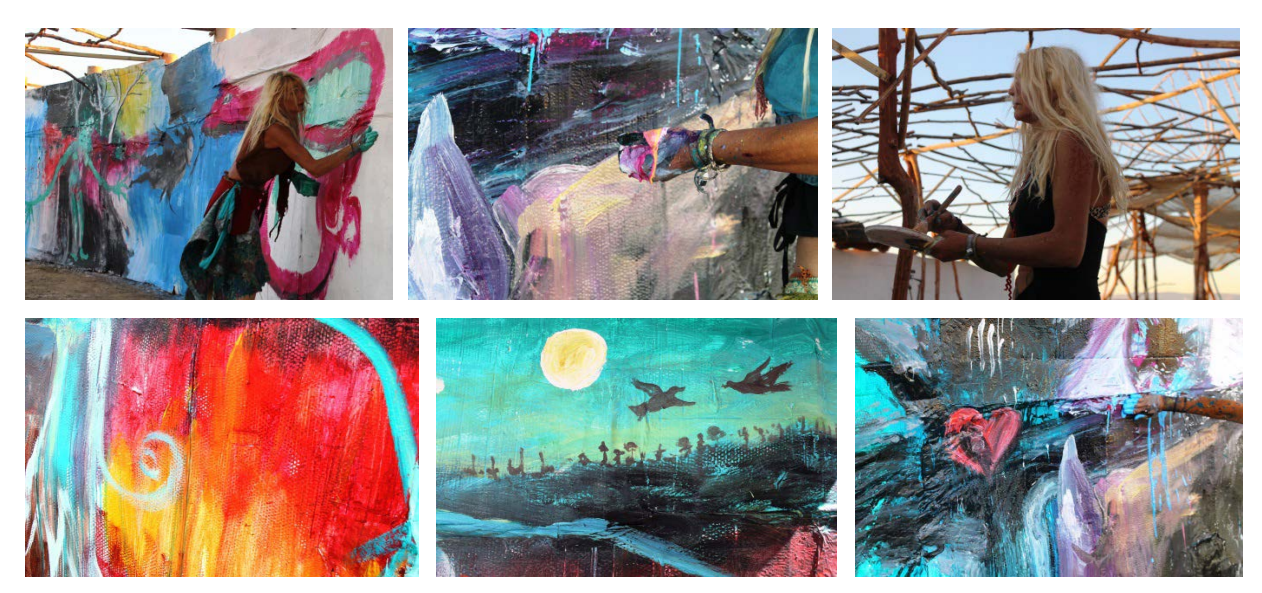
Figure 19 Aspects of Return to Chaos painting performance.

Sometimes rapidly performed short and intense brush or hand-strokes quickly fill and define spaces with colour, and on other occasions, long swooping motions express new ideas, occasionally also linking images to each other, which in turn suggests new possibilities (figure 19). She uses paint tin lids as palettes upon which to mix desired colours, but quite often this method was deemed too cumbersome and she mixed colours directly in her cupped hand. On