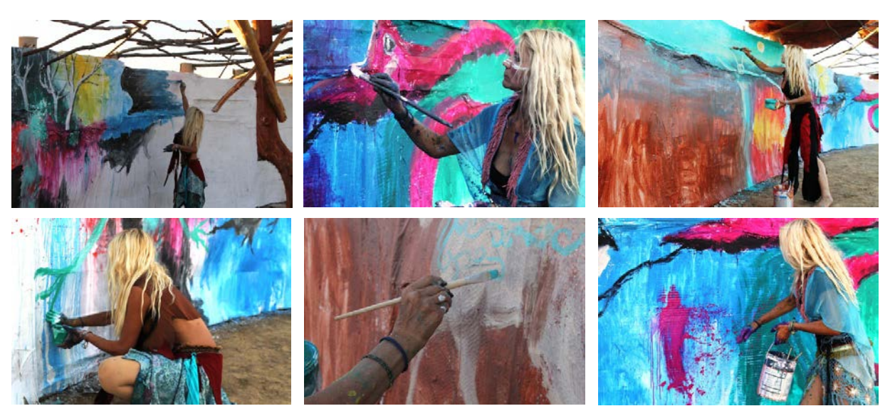
Figure 18 AntheA Delmotte performance painting Return to Chaos (photos: John Steele).

course serve as holding spaces – that sometimes hint at 'real' world landscapes – for forms that become suggested by shapes emerging therefrom, or subconscious ideas. Times of frenzied paint application by means of throwing, brush, or directly by fingers and hands, are occasionally interspersed by contemplative and seemingly serene interludes when particular compositions are being resolved or, for example, when just the merging of juicy colour for the sheer joy and tactile intensity of that moment is being dwelt in and savoured.