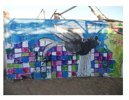
Figure 20f Left hand segment (photo: AntheA Delmotte).

Other observations can be added, but for the purposes of this paper, at this point, it is probably most relevant to say that in general, this mural is about her subconscious dwelling on perceptions and misperceptions, and finding ways to conjoin and make sense of both chaos and order within temporalities of self, family and society. Certainly, for Delmotte, the final statement regarding emerging from chaos (figure 21), being in chaos and Return to Chaos , happened at sunset on Saturday 30th April 2016 when she concluded the painting performances and then ritually torched the installation (figure 22).