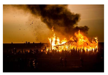
Figure 14 Performing Organism , 2015.