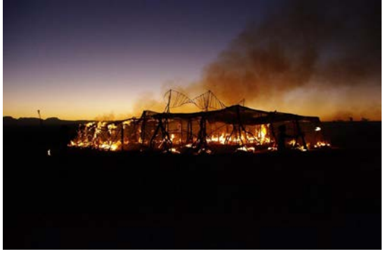
Figure 2b Tankwa Town map, 2016, created by Davina Return to Chaos was burnt by AntheA Delmotte at AfrikaBurn on Sat 30th April 2016 (photo: Trace Rosekilly).

The AfrikaBurn 2016 WTF? Guide (1-54) lists an astonishing number of registered "site and time specific" (Kristen 2003: 343) spectacles, including 83 installation artworks, of which 38 were due to be ceremonially burned; 94 theme camps; 81 mutant vehicles; and 13 scheduled performances. These are supplemented by hundreds of other unlisted, usually interactive, creatively inspired events daily. AfrikaBurn participants are both performers and audience, together, and for each other, in a pluralistic, "self-expressive heterotopia" (Steele 2015: 189, citing Fortunati 2005: 152; and Foucault & Miskowiec 1986). As has also previously been outlined in greater detail (Steele 2015: 189; Gilmore 2010: 38), eleven guiding principles provide a conceptual framework that encourages individual and collective creative expression