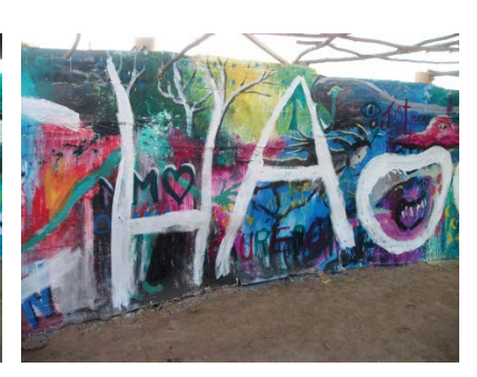
Figure 20c Centre right segment (photo: AntheA Delmotte).