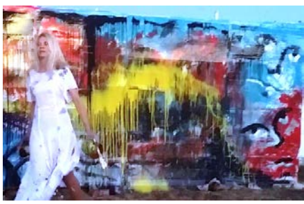
Figure 8b AntheA Delmotte, Good and Bad and Society, 2014, performed with Croak at Steenbokfontein.