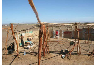
Figure 9b Packing the truck, and then building Return to Chaos.