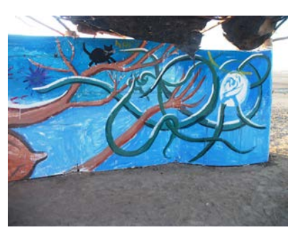
Figure 20a Far right segment.