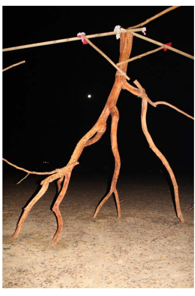
Figure 9c Part of Return to Chaos as seen at night, with moon, centre left (photo: John Steele).

The following morning, I was delighted to see installations and other artworks spread out all over a centrally located, approximately 1.5 square kilometre (Travis Lyle email of 20 July 2016) open space allocated to artworks, known as the playa . The work that immediately caught my full attention was Temple //Xam , which was being finished off by Kim Goodwin and the Dandylions (AfrikaBurn WTF? Guide 2016: 33). This team, from the Midlands in KwaZulu-Natal, created a welcoming and quite interactive installation featuring woven wattle arches in various configurations. A semi-enclosed raised observation platform was accessible by means of four separate stairways that widened as one climbed upwards. These stairways were oriented to the four cardinal directions, and embraced a small womb-like crawl-into space under the platform, that could be accessed from ground level. Temple //Xam , composed of carefully controlled yet freely flowing curvaceous contours, became an installation favoured by some as a space for reflection and meditation, as well as impromptu musical and other performances.