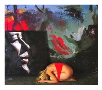
Figure 8a AntheA Delmotte, Cross-Pollinate poster, 2014 (photo: AntheA Delmotte).

... the burning" (AfrikaBurn WTF? Guide 2015: 24). This installation and performance ended in a poignant burn, which has been quite extensively documented (Steele 2015: 191-193; and by Matinino du Toit<sup>4</sup>). Interestingly, the focus on order in Organism acted as a foundation and launchpad for Return to Chaos at AfrikaBurn 2016.