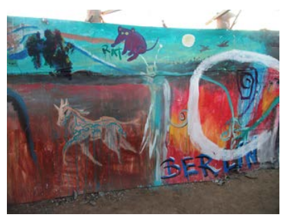
Figure 20d Centre left segment.