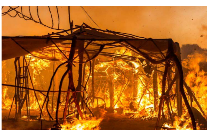
Figure 22 Returning to chaos.